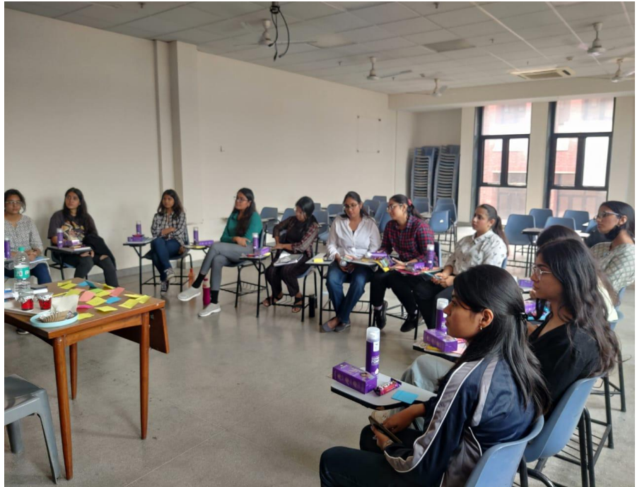
Focus Group Discussion with Bombae Shaving Company